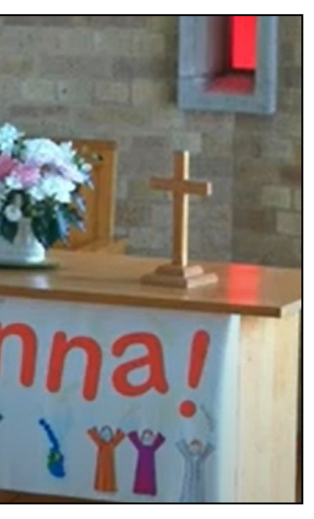
triumphal entry into Jerusalem