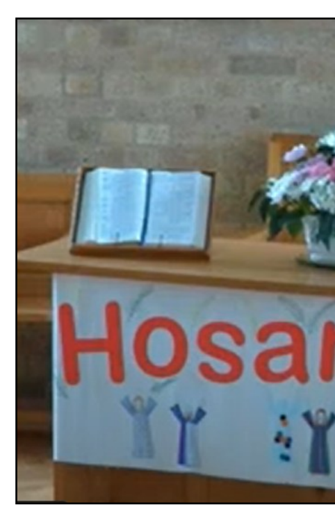
A banner created to illustrate the