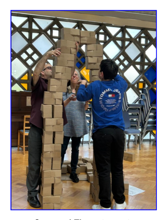
Success! The gateway to Jerusalem is almost complete