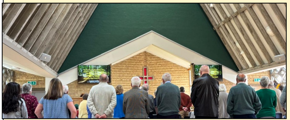
Christ is Risen—Hallelujah! Easter Sunday Worship