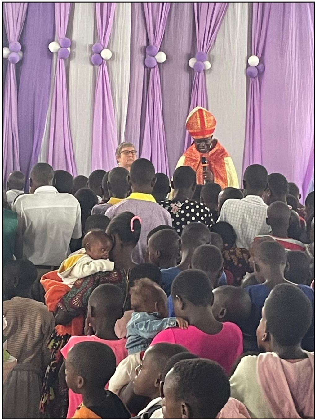
A larger congregation than at Castle Hill; 3,000 including 500 children!