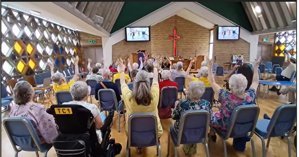
Above: Chair exercises to limber up ahead of the day's activities