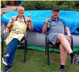
A welcome break for our two chefs